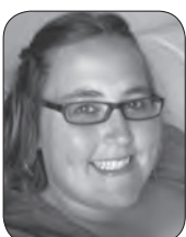
DISTRIBUTION Christy Brown