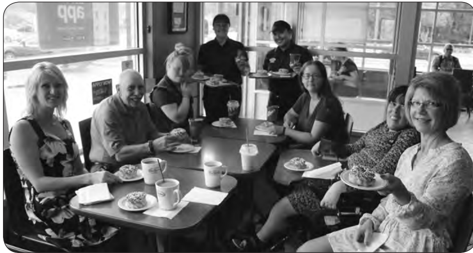
Members of Community Living Selkirk along with Tim Hortons employees try the Special Olympics Donut to help mark the Global Day of Inclusion at Selkirk's Tim Hortons Location on Main St. last Friday.