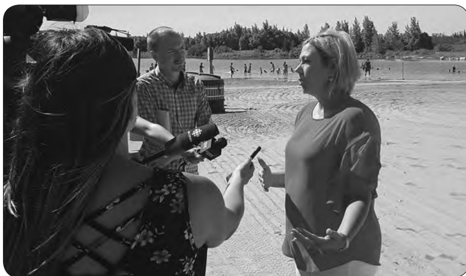
Sustainable Development Minister Rochelle Squires, pictured right, announces an expansion of the province's life jacket loaner program to Spruce Woods Provincial Park at Birds Hill Provincial Park during proclaiming National Drowning Prevention Week last Wednesday.

"A tragedy on the water can occur in the blink of an eye, which means never leaving children alone near