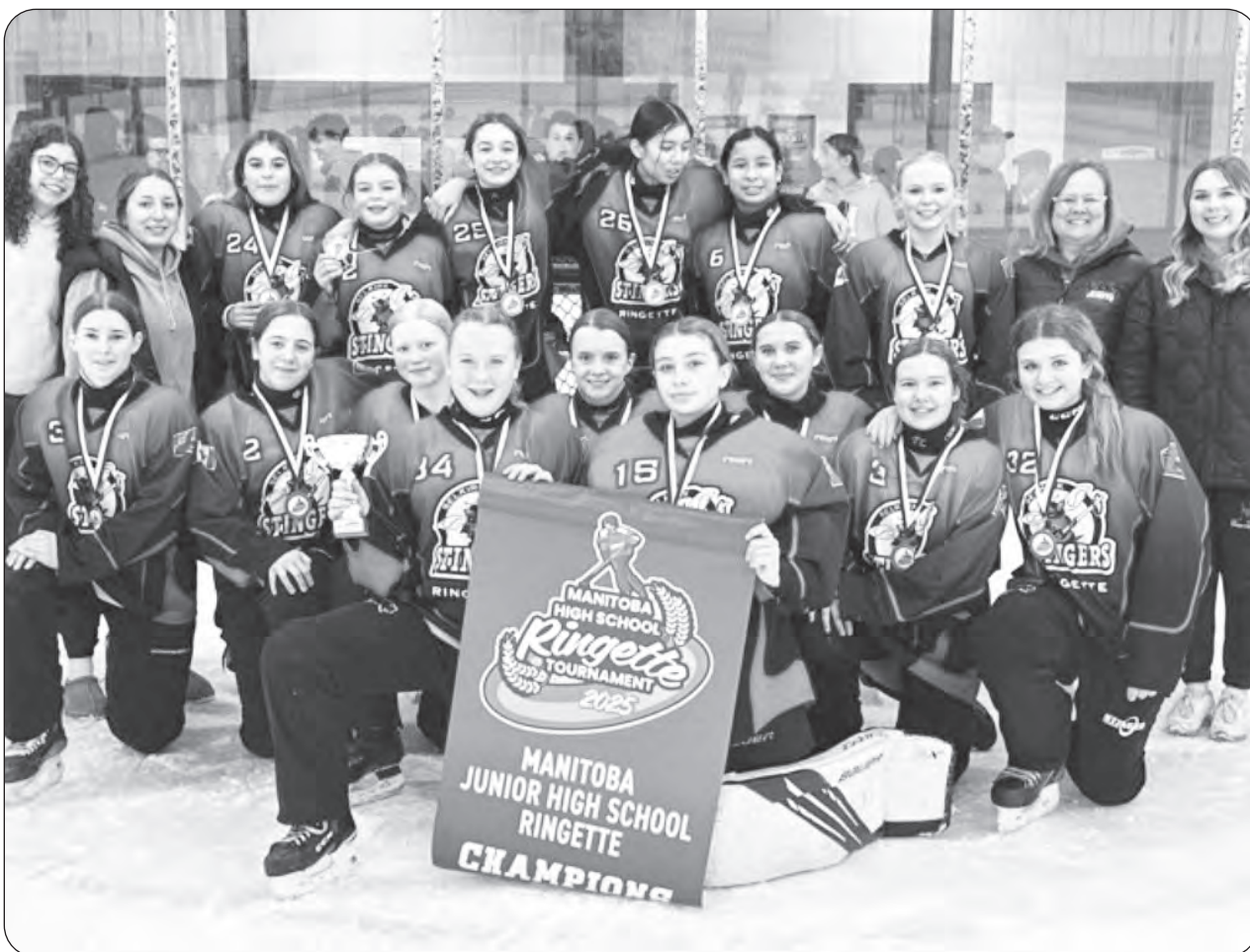
RECORD PHOTO SUBMITTED

They carried that momentum into the semifinal with an 8-3 win over Collège Béliveau Family of Schools to punch their