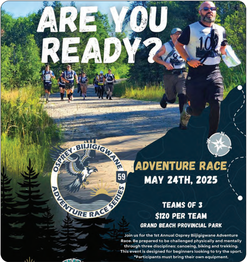
Check out the Osprey Bijigigwane Adventure Race Series.