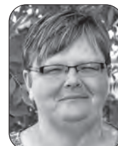
PRODUCTION Nicole Kapusta