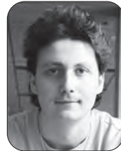
REPORTER/PHOTOGRAPHER Kieran Reimer