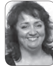
PRODUCTION Debbie Strauss