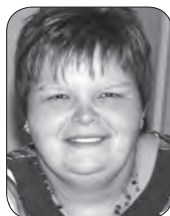
PRODUCTION Nicole Kapusta