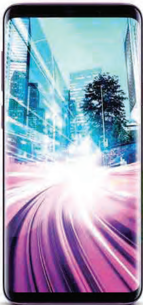
SAMSUNG Galaxy S9 | S9+

Join TELUS today or visit telus.com/network to learn more.