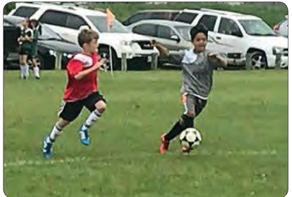
RECORD PHOTO SUBMITTED

Selkirk hosted the always-popular season-ending youth soccer tournament last month at the Rec Complex.