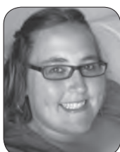
DISTRIBUTION Christy Brown