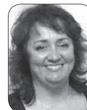
PRODUCTION Debbie Strauss