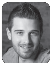
REPORTER/PHOTOGRAPHER Austin Grabish