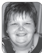
PRODUCTION Nicole Kapusta