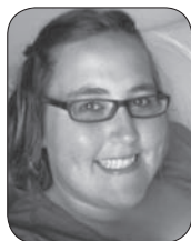
DISTRIBUTION Christy Brown