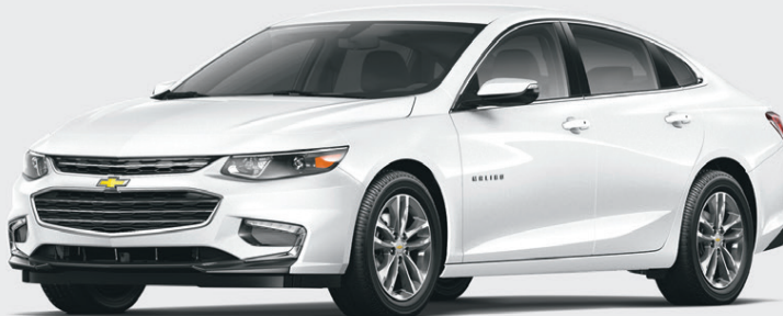
LIZ MODEL SHOWN