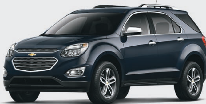
LTZ MODEL SHOWN

WITH $2,425 DOWN. BASED ON A LEASE PURCHASE PRICE OF $28,695* (INCLUDES FREIGHT AND PDI)