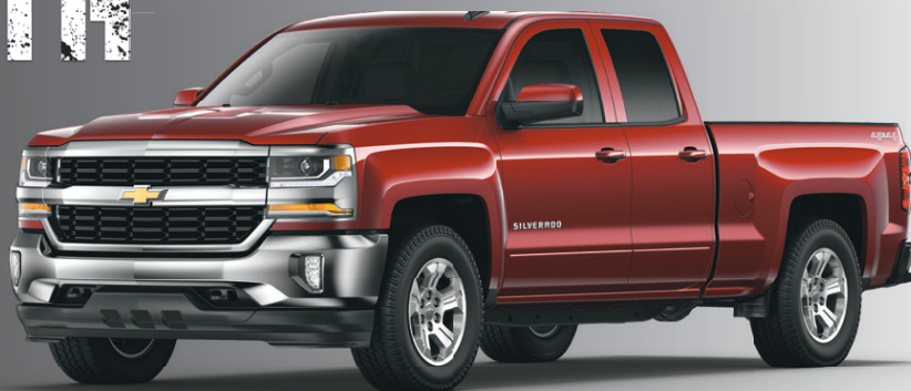
LT MODEL SHOWN

INCLUDES: $3,000 DELIVERY CREDIT, $5,180 CASH CREDIT, $820 PACKAGE DISCOUNT ON 2016 SILVERADO DOUBLE CAB TRUE NORTH EDITION.