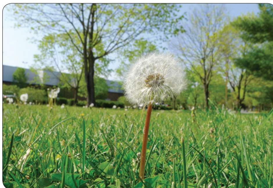
Weeds, such as dandelions, can quickly take over lawns and gardens.

Few things can be as troublesome to gardeners and landscapers as weeds. Weeds seemingly spring up overnight and quickly can overrun lawns and/or garden beds. Landscaping enthusiasts may spend countless hours and weekends coping with weeds without truly getting to the root of the problem. However, preventing weed growth need not be so difficult.